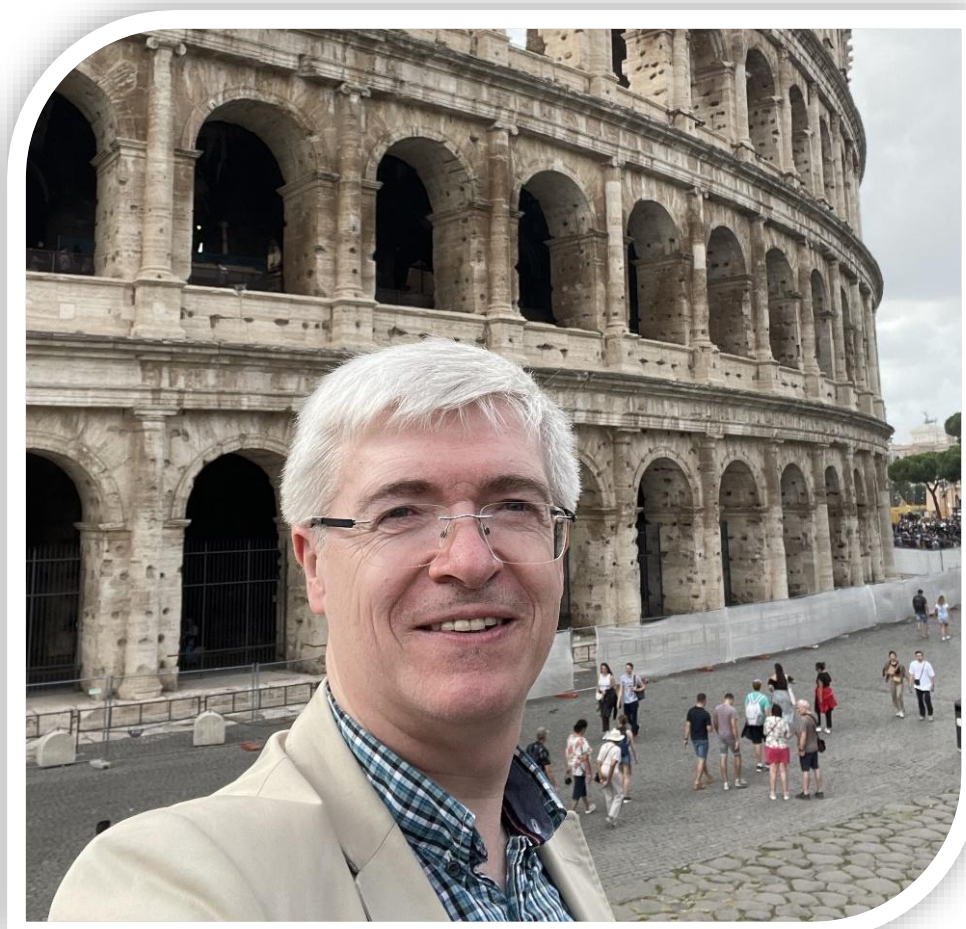
At the Colosseum in Rome